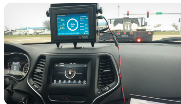
Columbia Weather Systems Magellan MX500 Weather Station meteorological data.